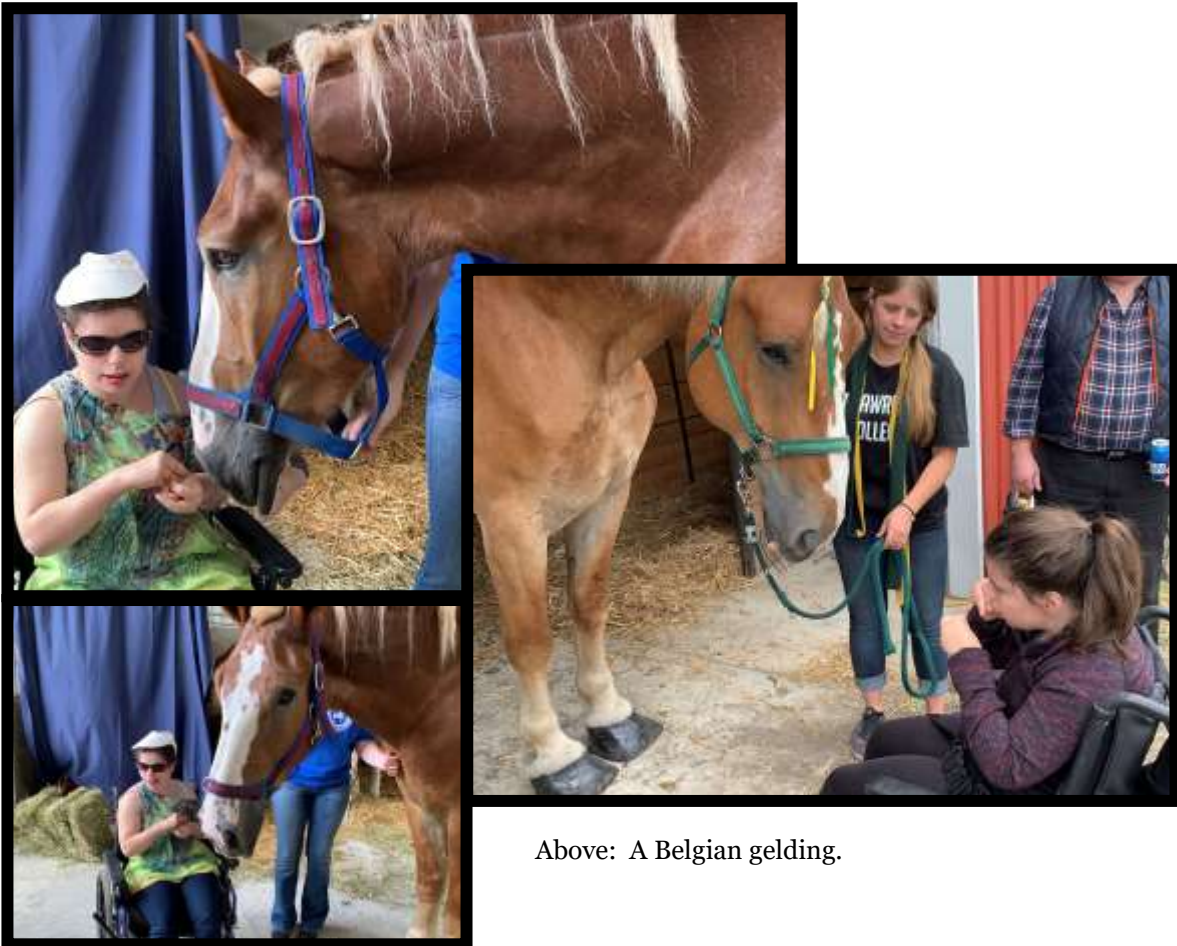
Above: A Belgian gelding.